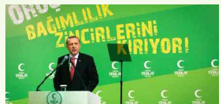
Turkish Prime Minister Recep Tayyip Erdogan addressing an Aftar meeting arranged by Turkish Green Crescent.