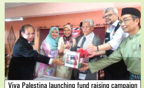
Viva Palestina launching fund raising campaign for Gaza Medical and humanitarian relief.