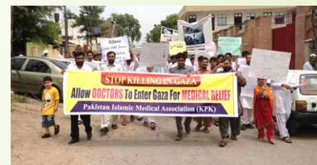
PIMA Peshawar arranged a protest rally in solidarity with the doctors who were waiting in Egypt to enter Gaza for medical help.