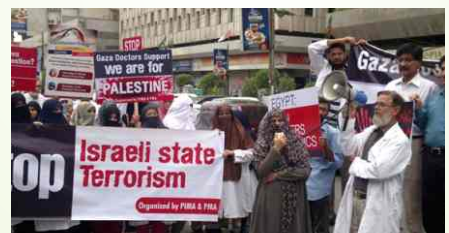
PIMA Karachi arranged a protest rally in solidarity with the doctors who were waiting in Egypt to enter Gaza for medical help.