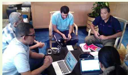
Doctors in Cairo, waiting for entry into Gaza for extending medical help.