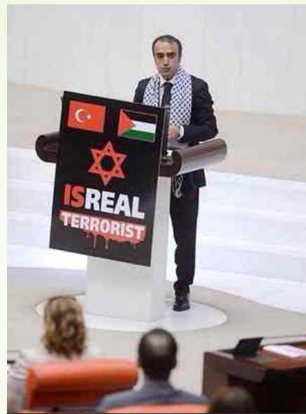
"An AK Party MP is addressing Turkish Parliament accusing Israel a terrorist state!"

FIMA has successfully purchased and stored most of these essential goods in Cairo, with the assistance of our partners in Egypt, Arab Medical Union (AMU), Islamic Medical Association of Egypt (IMAE) and PIMA (Palestinian