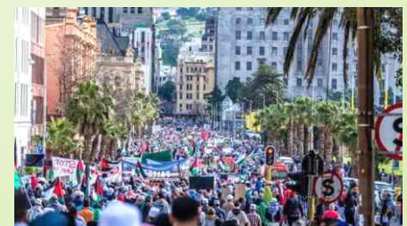
Protest rally in Cape Town, IMASA was one of the hosts.