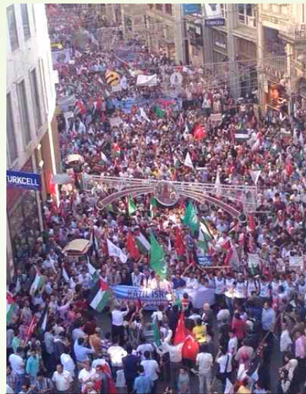
Solidarity with the people of Gaza, a rally organized by DWW and IHH Turkey opposite Israel embassy in Istanbul

Our FIMA representatives in Cairo are still in negotiations with the Egyptian authorities. We have been given verbal consent to enter Gaza