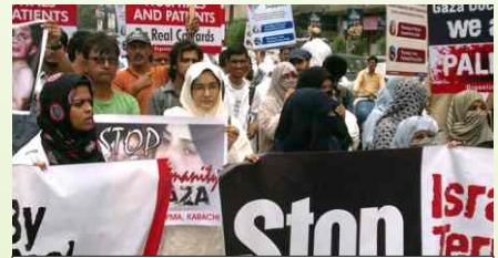
PIMA Karachi arranged a protest rally in solidarity with the doctors who were waiting in Egypt to enter Gaza for medical help.