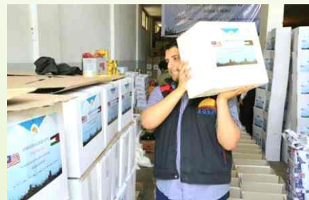
Ramadan food basket program by VPM.