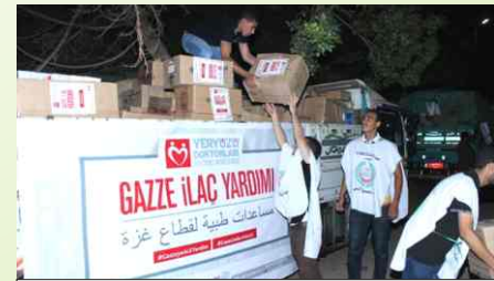
Doctor's World Wide (Turkey) dispatch emergency medicine and disposables to Gaza.