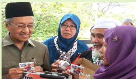
Former Malaysian Prime Minister Dr Mahatir Muhammad purchasing the donation tickets.