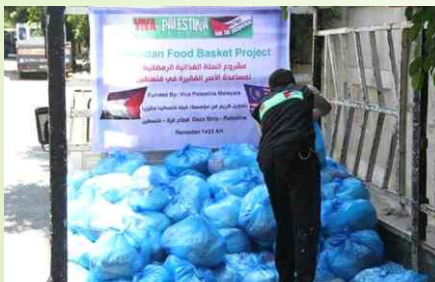
Ramadan food basket program by VPM.