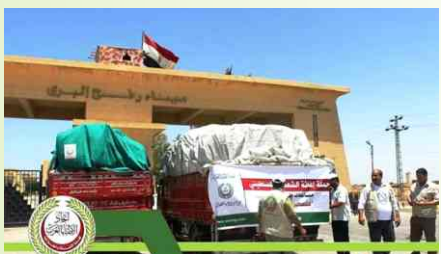
Arab Medical Union consignment of life saving medicine waiting at the Raffah border.