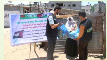
Ramadan food baskets distributed by viva Palestina Malaysia.