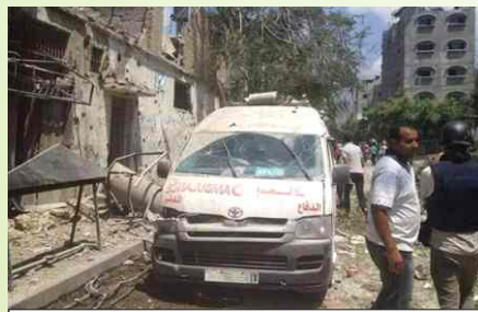
Al Shifa hospital immediately after bombing