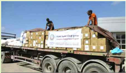
Arab Medical Union convoy carrying the medicine (first five trucks)