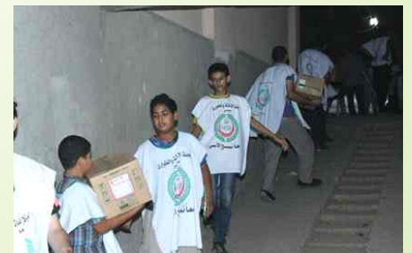
Medicine & supplies dispatched inside Gaza