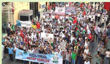
"... a rally organized by NGOs in Turkey opposite Israel Embassy in Istanbul."