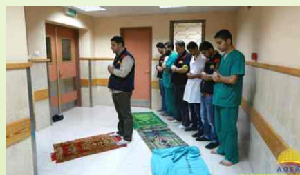
Salat ul Maghrib after breaking fast in a Gaza hospital