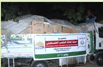
Medicine & supplies dispatched inside Gaza