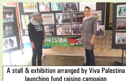
A stall & exhibition arranged by Viva Palestina launching fund raising campaign for Gaza Medical and humanitarian relief.